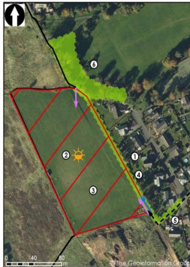
© Crown Copyright and database right 2011. All rights reserved.

3.18 The 2 hectare site is allocated for housing in the Consolidated Local Plan 2011 (ADUNS010) with an indicative capacity of 30 units. However, this is a relatively low density and so the outline development appraisal has included a base case of 30 units for ECH, and then has included a scenario of an additional 20 units of mixed tenure to test viability at a higher density.